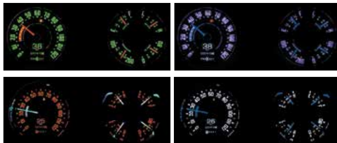
Over 30 Different LED Color Options to Choose From